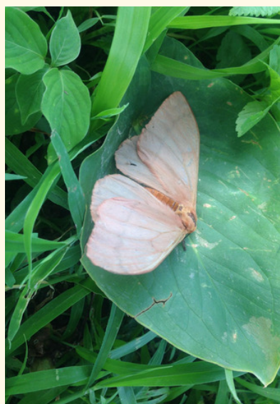
Scorpion and moth sightings in Ullo