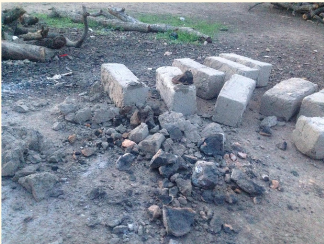
Brick testing being conducted