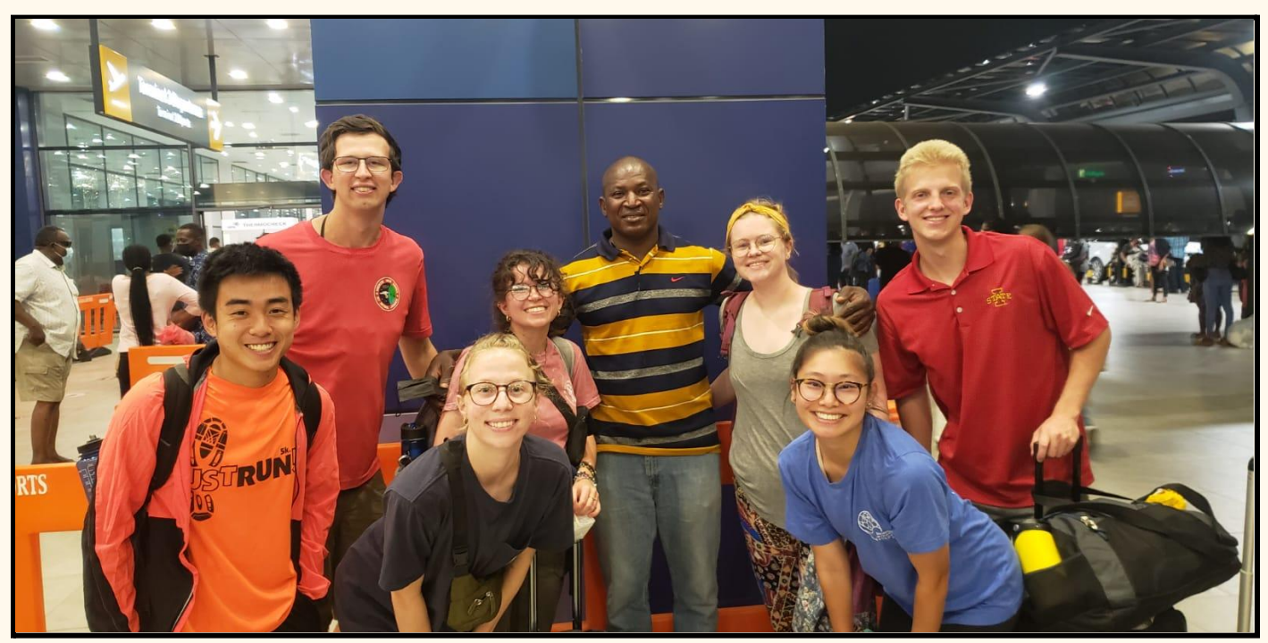
The team leaving from Accra airport, looks like they've had an amazing time in Ghana.